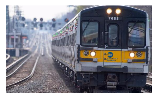
Looking west from the LIRR station in Floral Park April 12, 2017.

Third Track is the Right Track for Stony Brook University